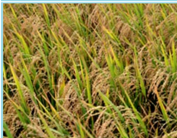
Fig.2. Field view of Binadhan-8

Binadhan-8 is a salt tolerant high yielding rice variety which is released in 2010. It is semi dwarf, early maturing and medium bold grain rice variety. Binadhan-8 requires 130-135 days to mature. It is moderately resistant to bacterial leaf blight, sheath blight, brown plant hopper, stem borer and rice hispa. Under salt stress, maximum grain yield is 5.5 t/ha (average 4.5-5.5 t/ha) and in non saline area, maximum 9.0 t/ha (average 7.5-8.5 t/ha). This variety is most suitable in saline areas of Bangladesh and also other non saline areas.