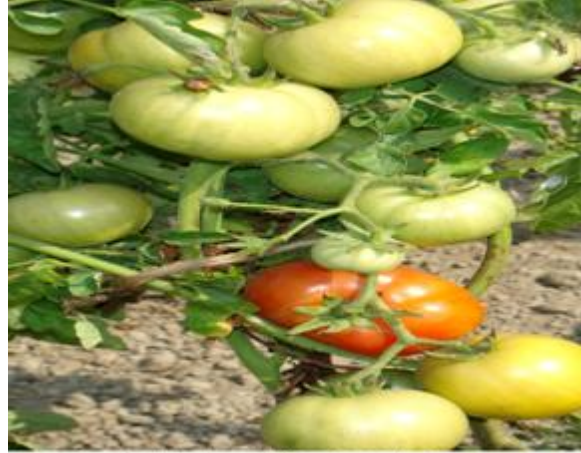
Fig. 07. Field view of Binatomato-7

Binatomato-7 is a tomato variety, released in 2011, suitable for cultivation throughout the year. Plants are determinate in habit. It requires 90-95 days to mature after transplanting. It produces 3-5 branches, 15-20 flower clusters, 10-13 fruit sets and 25-30 fruits per plant. Fruits are medium, fleshy, tasty and contain less number of seeds. Average fruit weight is 60 g. Vitamin-C content is 22.43 mg/100g. Self life is 20-25 days. Fruit is round and red in colour at ripening. Average yield is 87 (t/ha) in winter and 43 (t/ha) in summer. It is moderately resistant to wilt, early blight and leaf curl, tolerant to mild salinity and water stress.