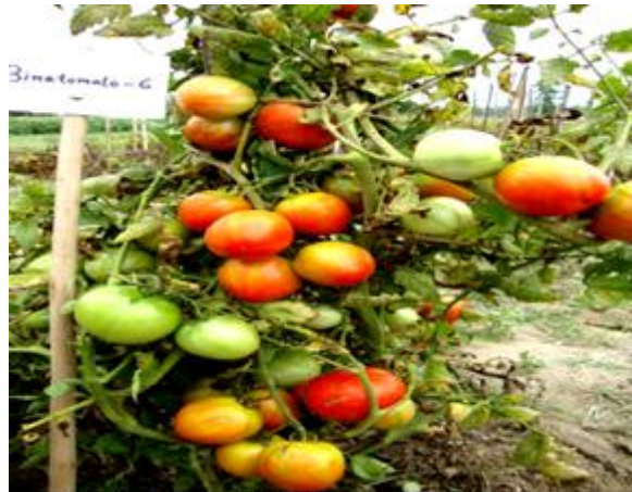
Fig. 06. Field view of Binatomato-6

Binatomato-6 is a tomato variety, released in 2010, suitable for cultivation throughout the year. Plants are determinate in habit. It requires 90-95 days to mature after transplanting. It produces 3-4 branches, 15-18 flower clusters, 10-12 fruit sets and 30-35 fruits per plant. Fruits are medium, fleshy, tasty and contain less number of seeds. Average fruit weight is 55 g. Vitamin-C content is 19.40 mg/100g. Self life is 25-30 days. Fruit is round, pointed at the opposite of calyx and red in colour at ripening. Average yield is 85 (t/ha) in winter and 40 (t/ha) in summer. It is moderately resistant to wilt, early blight and leaf curl, tolerant to mild salinity and water stress.